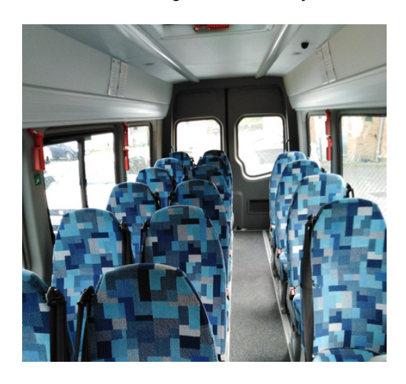
Tickets available to buy at the Information Centre or online at www.faringdonbuscommunity.co.uk